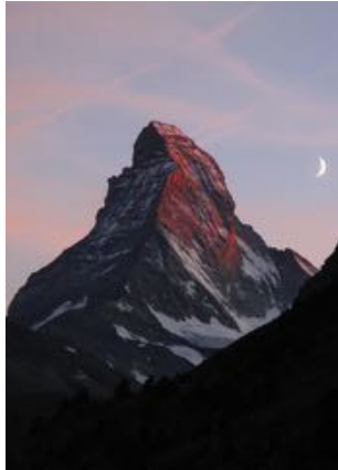
Sunset on the Matterhorn

with interest in C.G. Jung and Analytical Psychology. “The earth has a spirit of her own,” Jung mused, and elsewhere he called it the genius loci , the spirit of the place. It is this, the particular genius loci , that infuses each Odyssey as it leads us to a different place in Switzerland each year and inspires each Odyssey’s topic. So, too, this spirit imbues our presenters’ analytic views on contemporary research in a variety of fields, and as well, their handling of traditional areas of Jungian interest—fairytale, dream, myth, art, religion, personal and collective experience, clinical practice.