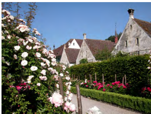
Photo Below: Kartause Ittingen, the Klausen Garden [ Kartause Ittingen_Klausen_Garten_1 ], courtesy of Kartause Ittingen ©.