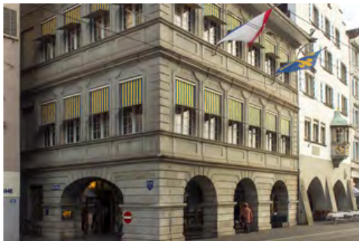
Zunfthaus zur Saffran