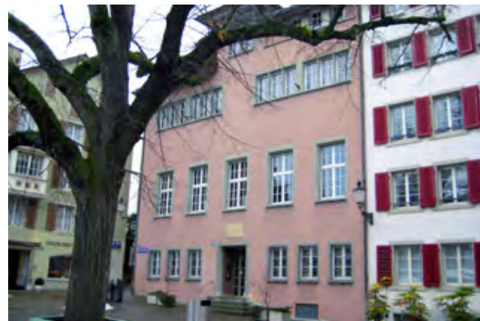
Lavatersaal at St. Peter's Church

Friday, October 9 , 6:00 pm: Reception; 6:30pm: Lecture; 7:30-9:00pm: Three-Course Dinner. Location: the historic Zunfthaus zur Saffran, Limmatquai 54, Zürich.