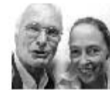
ISAP Opening Party, September 2004